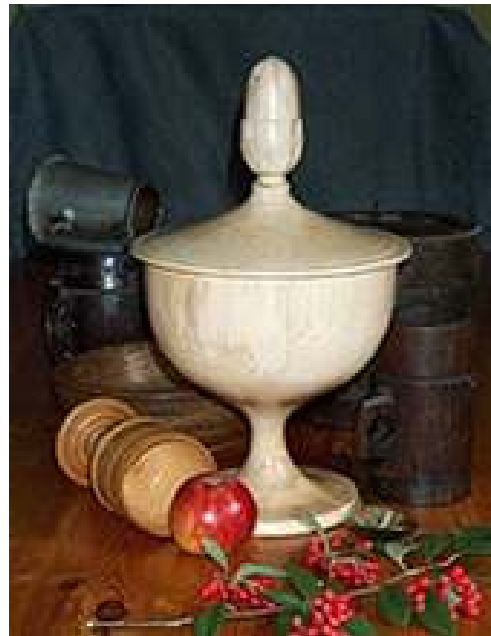
A modern Wassail Cup turned from sycamore

A drinking-cup of maple had a special name, mazer; and so I am wondering whether "rosemary tree" is a mondegreen for "real mazer tree" or some similar phrase.