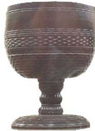
17 Century Wassail Cup

The Gloucester Wassail has "our toast it is white and our ale it is brown; Our bowl it is made of the white maple tree; With the wassailing bowl we'll drink unto thee." I am baffled by white toast, unless it means toast made from white bread, but I am sure that this is the right tree and the right symbolism. The October ale, brewed from the new harvest, was